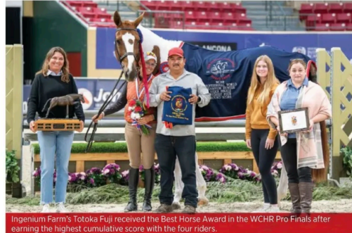
Ingenium Farm's Totoka Fuji received the Best Horse Award in the WCHR Pro Finals after earning the highest cumulative score with the four riders.